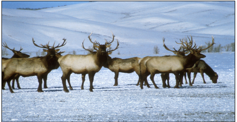
National Elk Refuge, Wyoming

In 1991, the endangered black-footed ferret was first released in Wyoming's Shirley Basin. Similar releases occurred on National Refuges and state managed lands across Colorado, Montana, and Arizona.